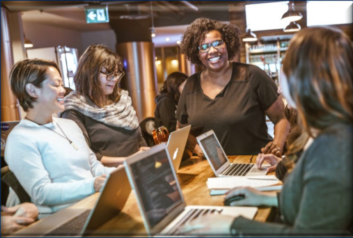
BSP Interrelated Special Education